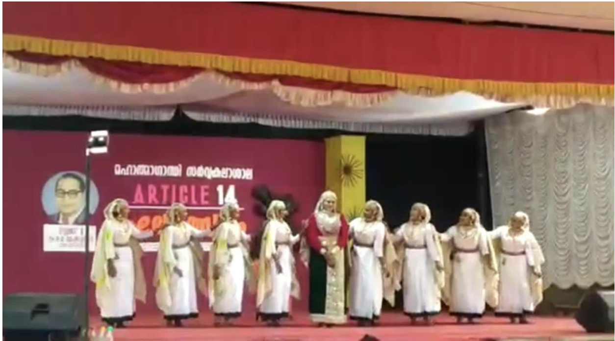
OPPANA TEAM OF SNM COLLEGE, MALIANKARA