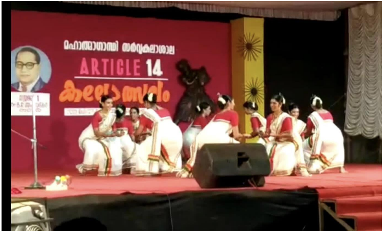
THIRUVATHIRA TEAM OF SNM COLLEGE, MALIANKARA