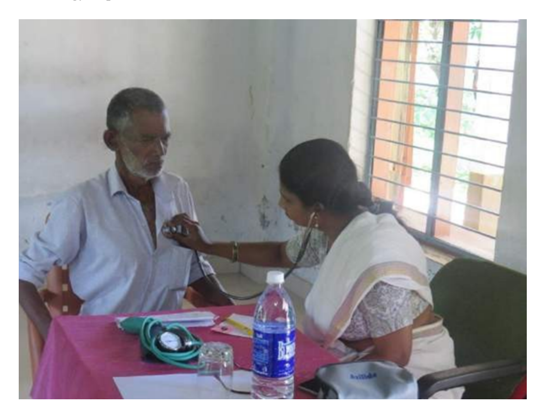
General OP department