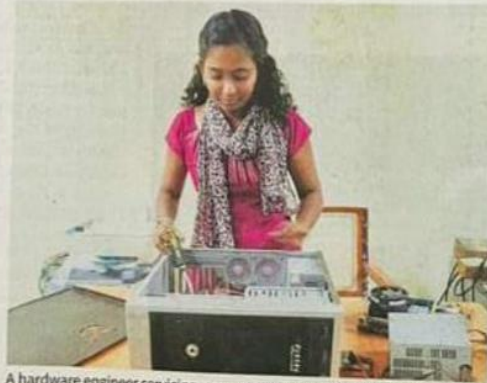
A hardware engineer servicing a computer at the IHRD centre in Kochi.

Initially, the 'Revive' programme has been launched